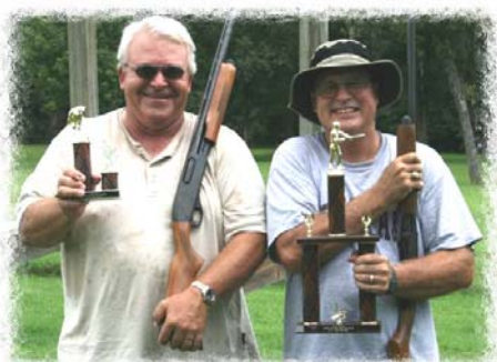
There are winners and losers!