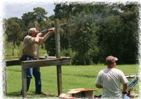
Our gun slinging Associate Department Head