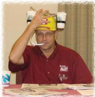
Our coffee drinking Department Head